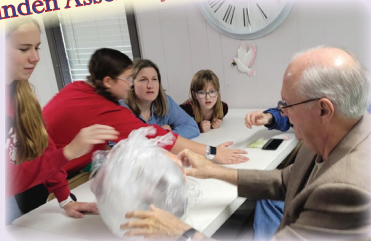
Such a fun game at Linden Assembly of God