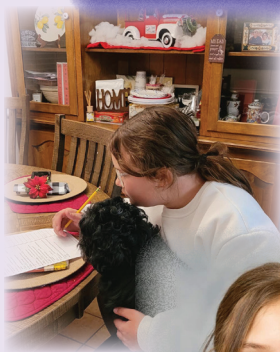
Our Sweet Sadie is Growing up!