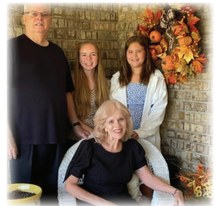
Our family enjoying the warmer weather on our porch