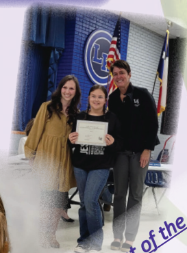
Student of the month!