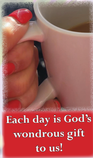
Each day is God's wondrous gift to us!